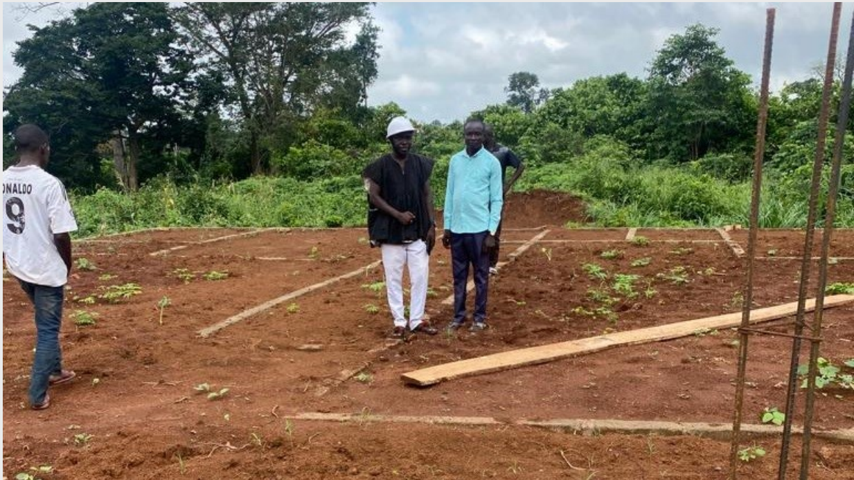
Building and infrastructure progress in the Traditional Areas.