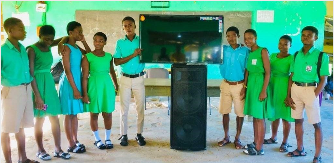
New equipment and supplies, including a motorcycle, television, and PA system.